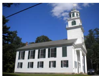
Park Hill Meetinghouse, Westmoreland