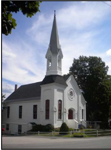
Newfields Community Church, Newfields

LCHIP is a Matching Grant Program created by General Court in 2000 through RSA 227-M. Matching grants are provided to municipalities and non-profit organizations to help with restoration of historic buildings and permanent conservation of natural resources.