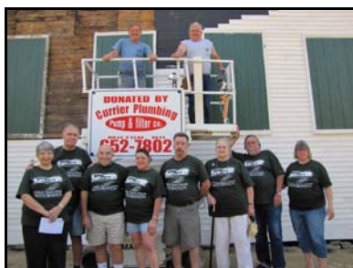
Milton Town House, Milton