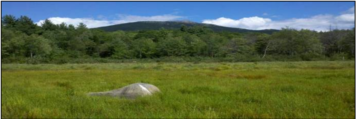
Mount Monadnock/Stowell Property