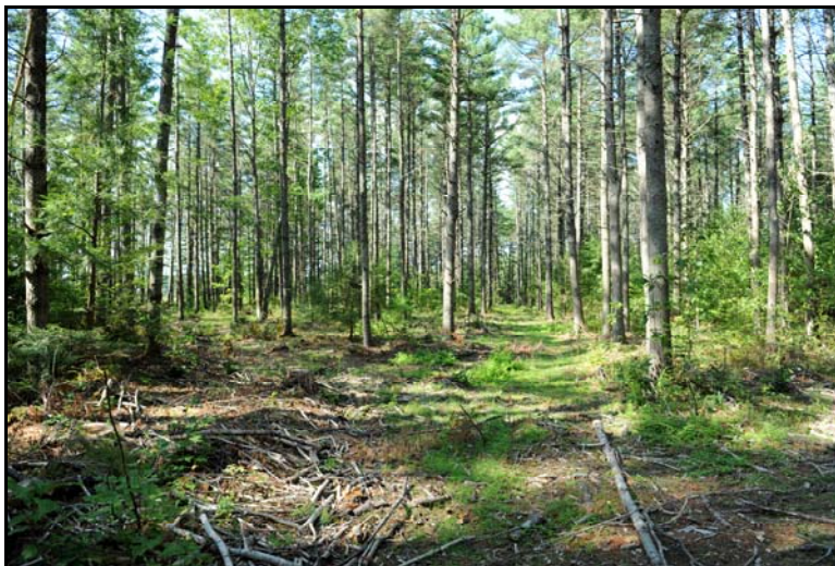
Union Meadows, Wakefield