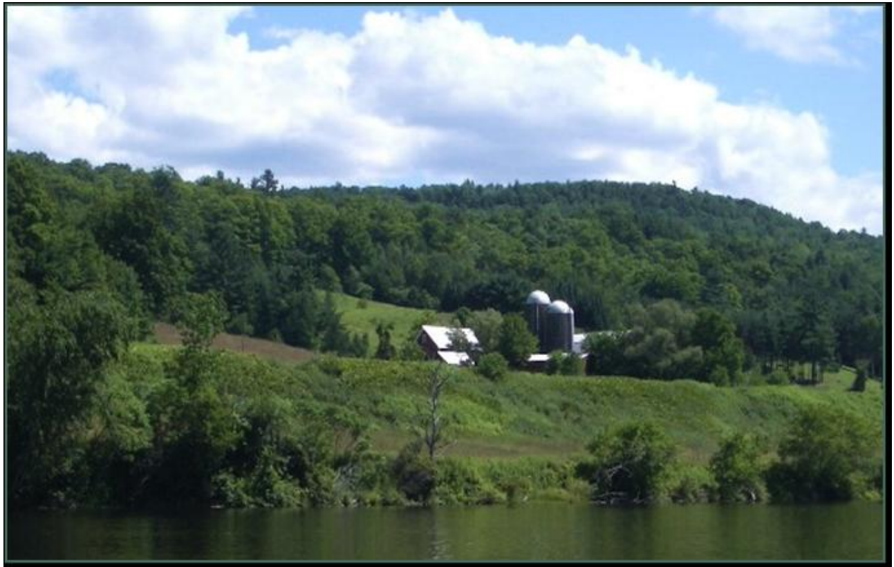
Johnson Farm & Islands, Monroe, NH