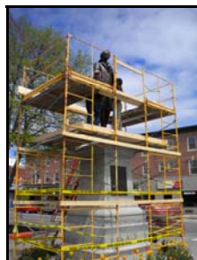
Parson Main Statue, Rochester