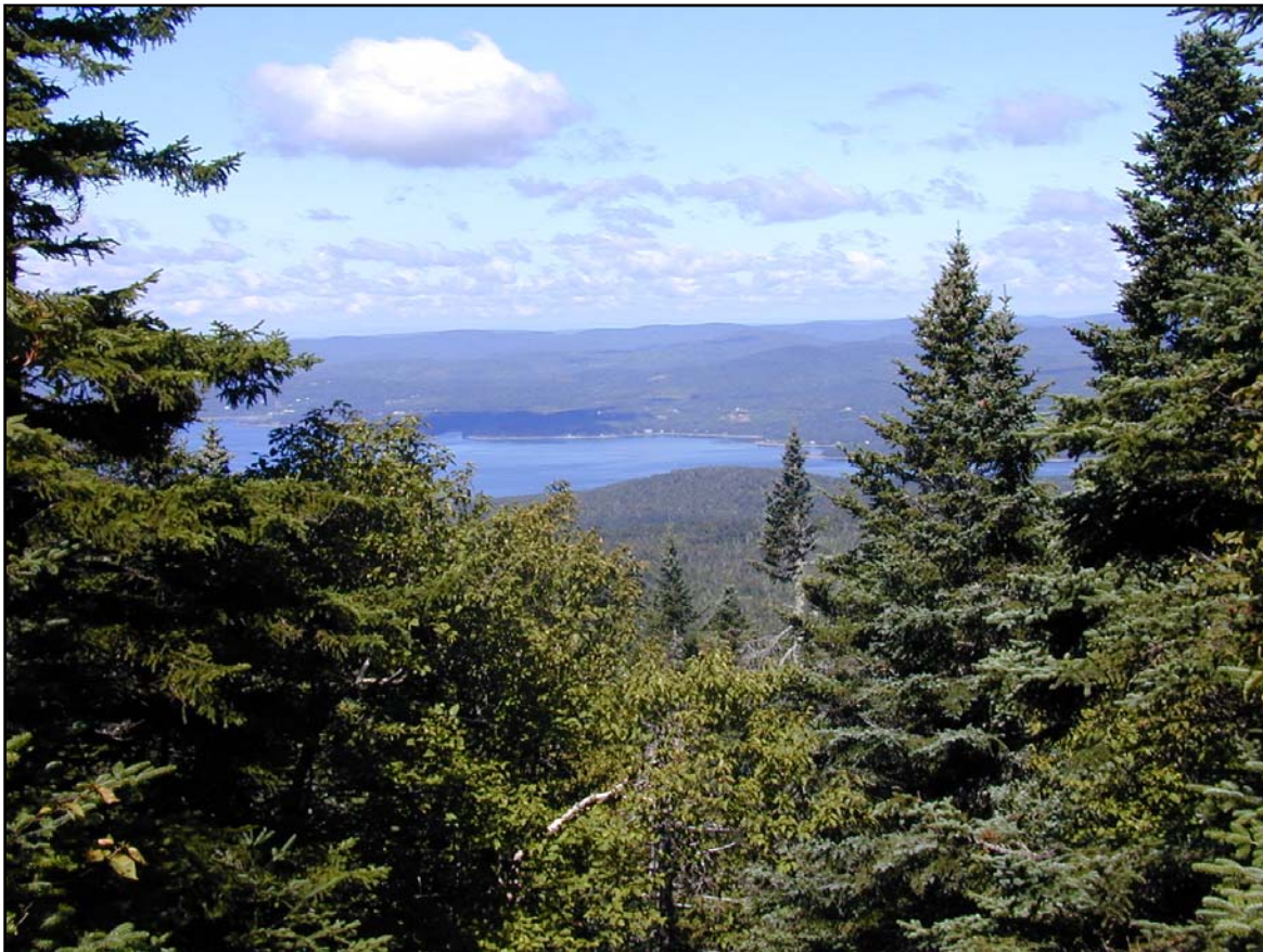
Connecticut Lakes Headwaters Project, 2002

Since FY 2009, LCHIP has provided an annual incentive payment to all recipients who provide satisfactory monitoring reports. Payments are based on the income to the Stewardship Trust Fund and the complexity of the monitoring requirements for each project. Payments this year ranged from $81 to $324 per project. Satisfactory monitoring reports were received from and payments made to 79 organizations and agencies for reporting on 120 different properties. None of the properties showed major violations, although a few have concerns that are being monitored for better compliance in the coming year. Only six projects that should have submitted monitoring reports failed to do so.