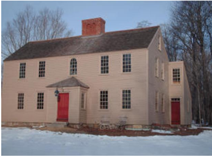
The Colonel Paul Wentworth House, Rollinsford