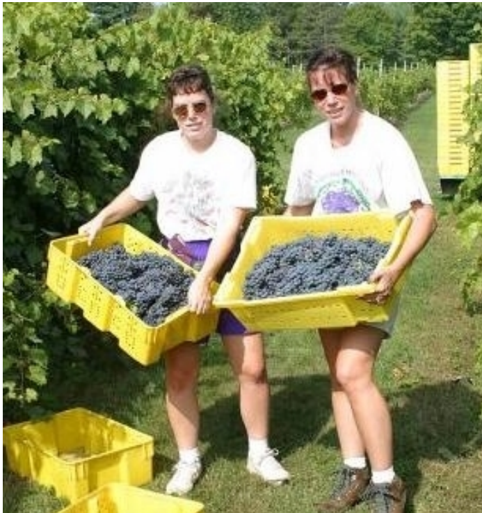
Flag Hill Winery, Lee & Epping

Originally built in 1701, the house was moved to Dover, MA in 1936 and relocated near its original site in Rollinsford in 2004.