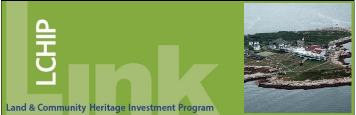
Oceanic Hotel, Star Island, Rye

"The story of these enslaved people in Portsmouth is not just a Portsmouth story. It's a New Hampshire story."