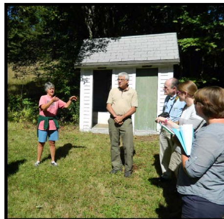
Site visit at Kelley Corner Schoolhouse, Gilmanton

VOTE! September 13 is the date of the primary for state and local offices. Be sure you know your candidates and make your vote count for the issues that are important to you.