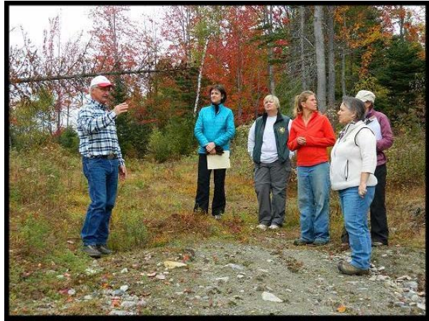
LCHIP staff on a site visit of the proposed Community Forest.

future and way of life. With The Trust for Public Land (TPL) and the Northern Forest Center, volunteers developed plans to create a 1,300-acre Community Forest which received a $190,000 LCHIP award in 2015. The Forest will be open for recreation including hunting and fishing and will provide an outdoor classroom for local students, timber revenue for the Town and forestry jobs for residents. Additionally, it will help ensure that working forests remain part of the way of life in this small North Country community. More here.