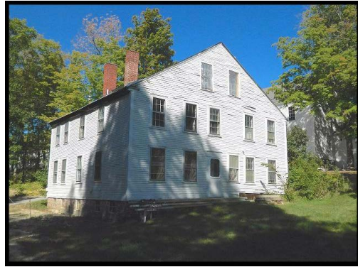
The Beehive - former dormitory of Francestown Academy.

The Beehive, constructed in 1846, is a former dormitory of the Francestown Academy. Dating to the era when many towns and villages had academies, the Beehive is a rare surviving example of a mid-19th-century dormitory that retains a remarkable degree of integrity despite decades of neglect. It is also notable for its unusual timber frame and sophisticated foundation. In 2015, LCHIP awarded a $90,000 grant to the Francestown Improvement & Historical Society to support the rehabilitation of the building. Work includes structural repairs, window restoration, roof replacement, and updates to the building's HVAC, plumbing and electrical systems. To learn more about the Francestown Improvement and Historical Society, visit their website .