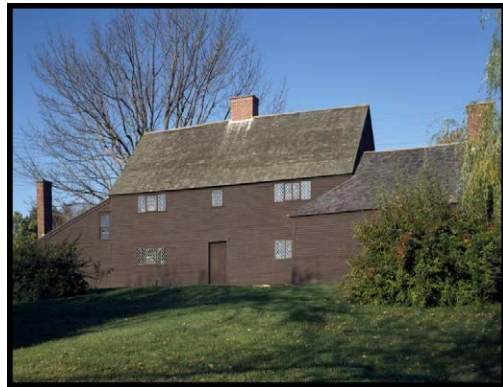
Richard Jackson House

The Richard Jackson House in Portsmouth is the oldest timber-frame building in New Hampshire. Owned by the same family from 1664 until its acquisition by the Society for the Preservation of New England Antiquities in 1924, the Jackson House retains its historic integrity thanks to a sensitive restoration in the early 1930s. Unlike the restorations of many First Period structures undertaken in the early 20th century, this project did not strip away all later alterations and additions, allowing the visitor to understand the evolution of the building through the early 19th century. In 2015, LCHIP awarded a $90,000 grant to Historic New England to support much-needed structural repairs, an archaeological survey, the installation of new drainage and a new wood-shingle roof. To learn more about the Jackson House, visit Historic New England's website or check out this month's LCHIP Road Trip!