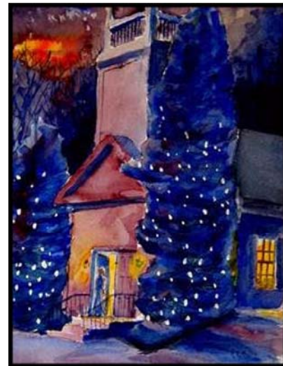
Watercolor by Calvin Opitz

The Church is also home to the famed holiday pageant depicted in Donald Hall's classic, Lucy's Christmas . In 2015, LCHIP provided an $80,000 grant to the South Danbury Church to support the rehabilitation of the building. Work to be done includes mold and moisture remediation; foundation, clapboard, exterior trim, and roof repairs; window and shutter restoration; and interior and exterior painting.