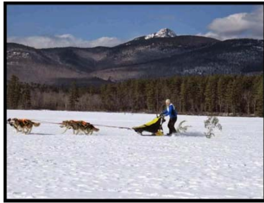
Sled dogs on Chocorua Lake

Pencil in the weekend of Feb 4-5, 2017 for the annual Tamworth Sled Dog Races on Chocorua Lake. Come watch 40-50 teams and hundreds of dogs race across Chocorua Lake and through the woods around the lake. Viewers are treated to a day-long New England experience steeped in tradition and heritage. Spectators are welcome to walk, snowshoe or ski onto the ice. Hot chocolate, chili, hamburgers and hotdogs are usually available, and there is often a bonfire where marshmallows are toasted.