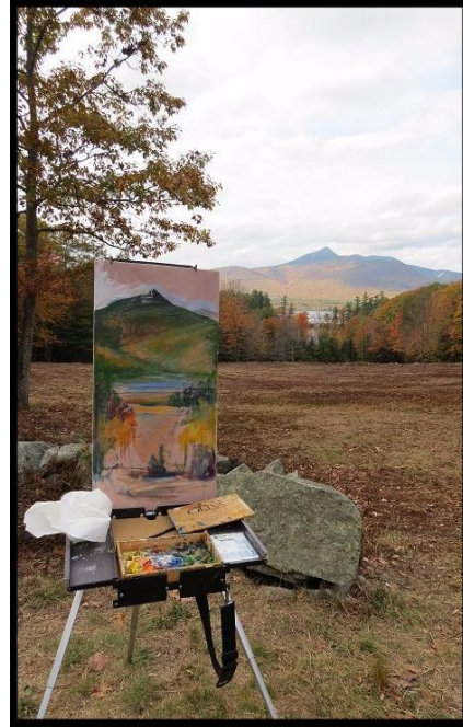
Mount Chocorua Viewshed

In 2014, the Chocorua Lake Conservancy began an effort to permanently preserve that view. This was enthusiastically supported by LCHIP which awarded an $88,000 grant to assist in the effort. Learn more about the Chocorua Lake Conservancy and the history of Mt. Chocorua here .