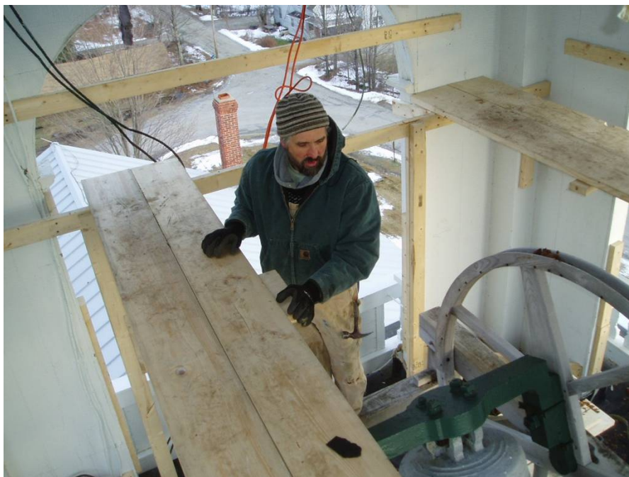
Acworth Meeting House in Acworth

In addition, these seventeen projects provided direct employment for more than a hundred New Hampshire workers, including carpenters, roofers, surveyors and many others. These jobs provided direct employee income of $1,343,490.