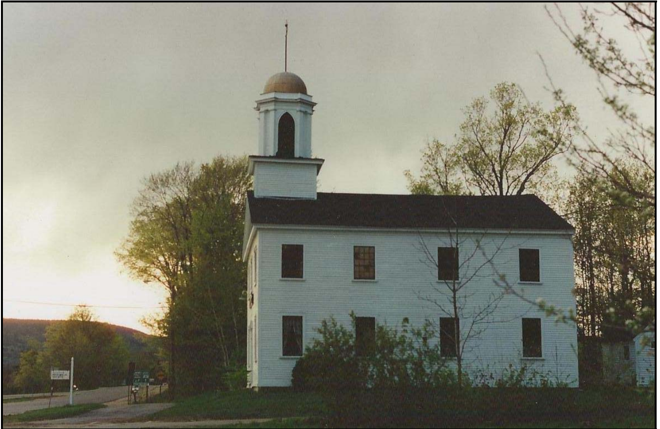
Austin Hall in Strafford