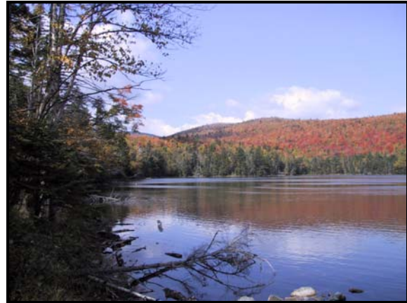
Pond of Safety in Randolph

Projects from LCHIP's first grant round, 2001