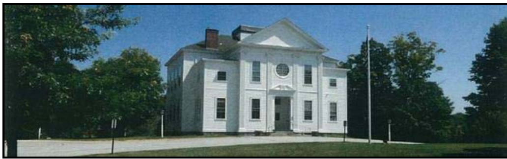
Gilmanston Academy in Gilmanston