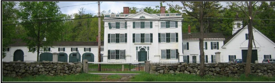
Barrett House in New Ipswich