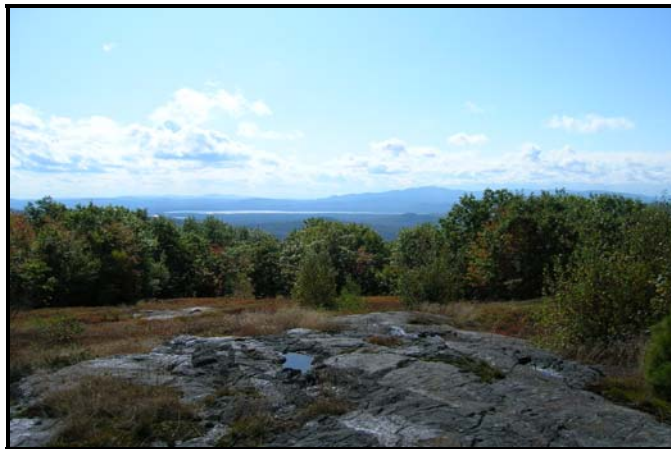
Foss Mountain in Eaton

Monies for specific projects are drawn from the Trust Fund. A portion of each grant award is also used to support the administrative costs of LCHIP, as are interest income from the Trust Fund and other LCHIP bank accounts. As required by the LCHIP enabling legislation, at the completion of each project, funds are transferred from the LCHIP Trust Fund to the Community Conservation Endowment, also held by the Treasury Department, to support long-term stewardship of the resources protected with state money through LCHIP.