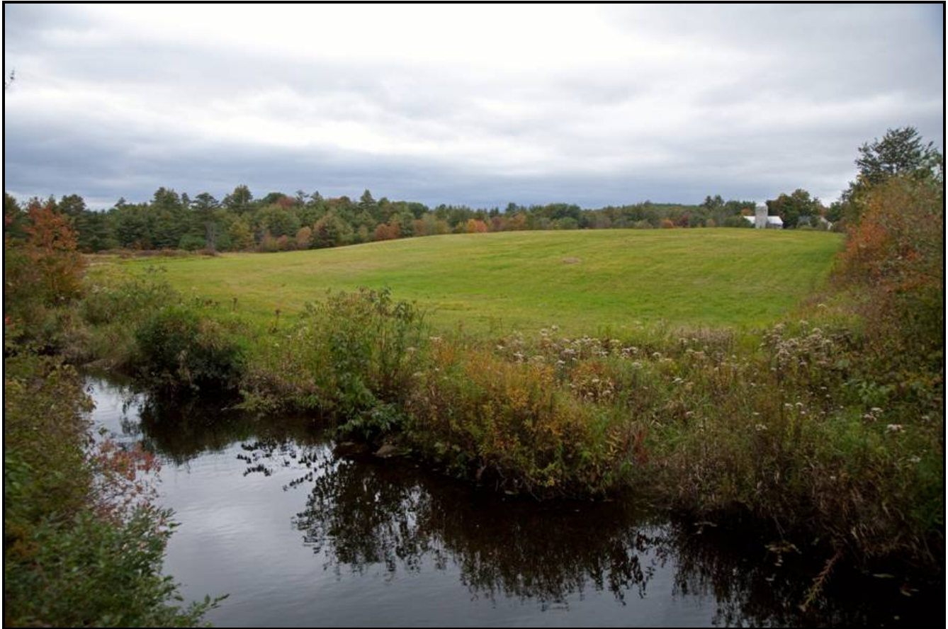
Battles Farm in Bradford

LCHIP held a grant round in the fall of 2010. Applications were received for 36 projects seeking $2.6 million in grant funding and representing a total project value of $32.4 million. In November, the LCHIP Board selected the twenty-four projects listed on the following page for funding.