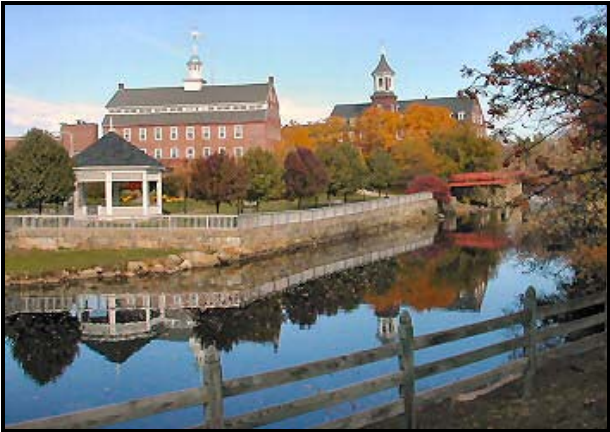
Belknap Mill in Laconia