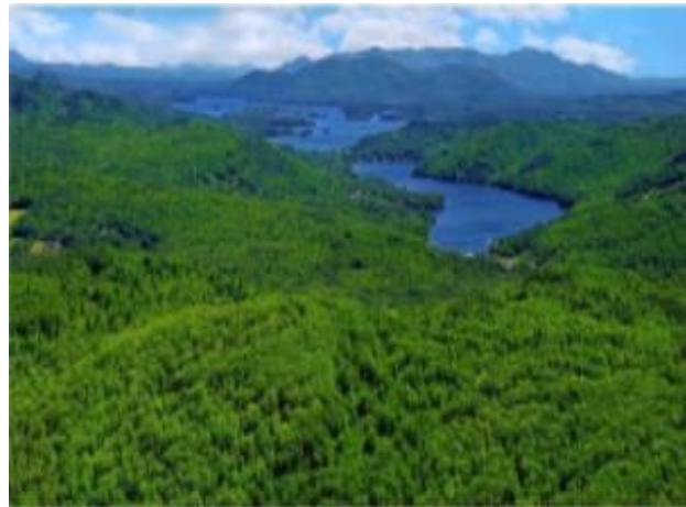
View of Squam Lake from Whitten Woods