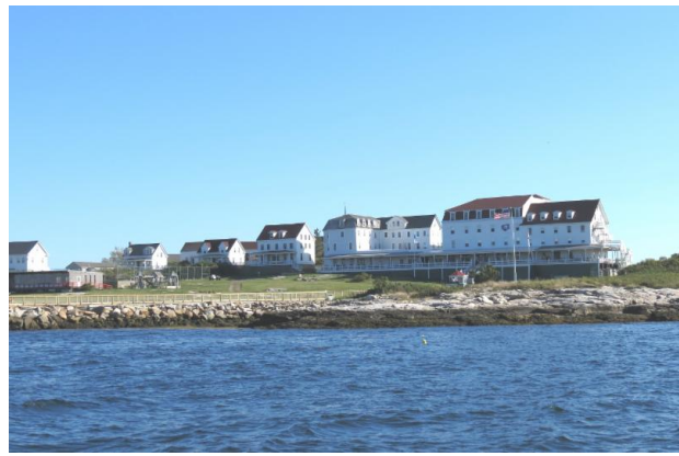
Oceanic Hotel, Star Island

The Oceanic Hotel on Star Island is a link to the 19th century Grand Hotel Era at the Isles of Shoals. The current hotel was cobbled together from buildings left after an 1873 fire destroyed the original Hotel. The long wooden veranda constructed to link them together has become a hallmark of the site. Today, the Oceanic Hotel welcomes 21st century visitors to Star Island and provides a glimpse back to a long lost era.