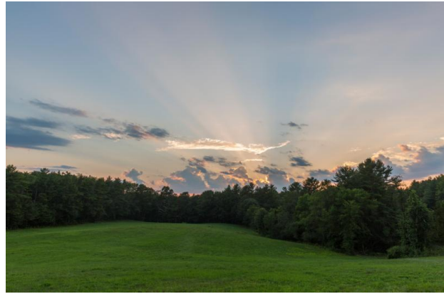
Powder Major Farm Hayfield

Buoyed by a $380,000 LCHIP grant in 2015, the Society for the Protection of N.H. Forests is well on its way to creating a new forest reservation in Madbury, Durham and Lee. The land, which lies within a Source Water Protection Area, will help protect drinking water supplies, working forest lands and important wildlife habitat. It will also provide opportunities for public recreation in this rapidly developing area of the State. The land has some interesting stories to share as well.