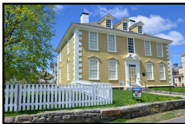
Public tours of the Wentworth-Gardner House are offered June through October.

Since its construction in 1760, the Wentworth-Gardner House has stood as the centerpiece of Portsmouth's South End neighborhood. Yankee Magazine recently listed this National Historic Landmark as one of the five best historic houses in New England. A fine example of the Georgian architectural style, the Wentworth-Gardner House has been struggling with ongoing moisture issues and plaster deterioration. A 2015 LCHIP grant for $24,090 is helping the Wentworth-Gardner and Tobias Lear Houses Association restore the second floor plaster ceilings, windows and pocket shutters, as well as rehabilitate the foundation and improve drainage. To learn more about the history of the Wentworth-Gardner House, visit the Wentworth Lear Historic Houses website.