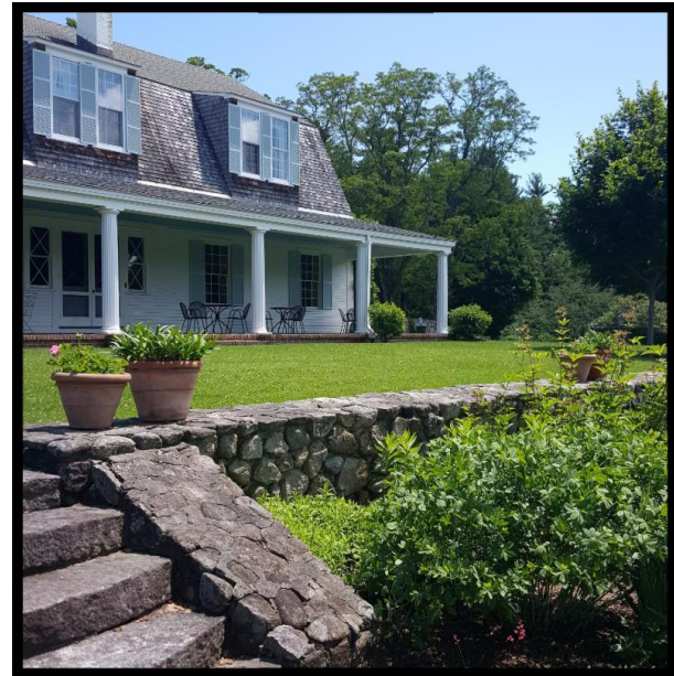
The Fells is one of New England's finest examples of an early 20th-century summer estate.

For more information on Artists Weekend, visit The Fells Calendar and Events page .