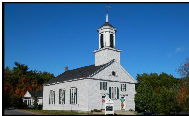
Windham Presbyterian Church

The 1834 Windham Presbyterian Church added a bell tower in the 1840s. Routine maintenance in 2011 revealed moisture damage to the structure and exterior of the tower. The Church paused the routine maintenance project and developed a revised scope of work to address the tower's issues. In 2015, Windham Presbyterian Church was awarded a $20,350 LCHIP grant to help with structural repairs, replacement of the tower's lower roof deck roofing, and rehabilitate the tower's dome and weathervane. Work is nearly complete, so check out the newly rehabilitated the Presbyterian Church the next time you're in Windham!