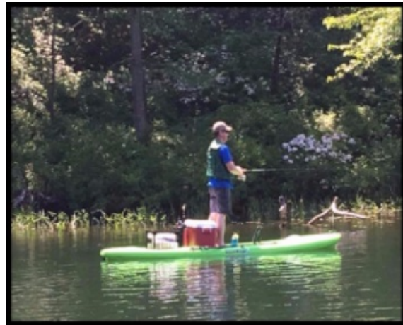
A few of the 50,000 feet of river frontage proposed for protection.

The 2016 grant applications are here! Forty-two applications (22 historic and 20 natural resource) were received by the due date of June 24. The proposed projects range from Northumberland to Portsmouth and Conway to Swanzey. They include historic museums, an elderly housing project, a small teaching farm and a rather astonishing ten-plus miles of river frontage. The total amount requested is just over $6 million, with an anticipated $3,500,000 available for grants.