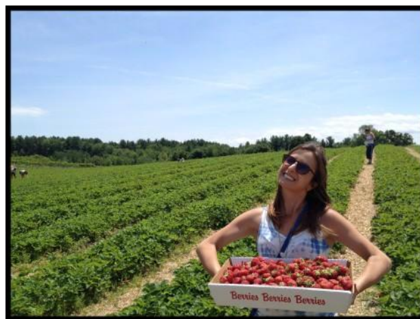
Three generations have shared in working the 28-acre Monahan Farm.

In 2015 LCHIP proudly awarded $85,000 to the Southeast Land Trust and the