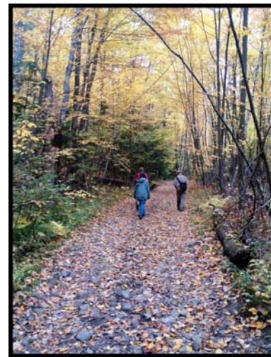
Site visit at Clay Pond.

Since 2007 the Town of Hooksett and Bear-Paw Regional Greenways (BPRG) have been working together to permanently protect an ecologically rich expanse of land surrounding Hooksett's Clay Pond. Soon, a 2015 LCHIP grant will help them expand the Clay Pond Conservation Area (CPCA) to more than 800 acres. An area of diverse and threatened habitats, the CPCA contains uplands, beaver impoundments, marshes, streams, and unique forests supplying abundant food for wildlife, including beaver, otter, moose, and bobcat, as well as a variety of waterfowl. A trail network provides access for hunting, hiking and wildlife observation and connects the CPCA with nearby conservation land. BPRG hosts an ongoing series of outdoor events exploring their 8,000+ acres of conservation land, including the CPCA. Learn more here!