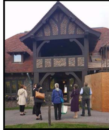
LCHIP Staff and Board Members tour LCHIP funded work at the Castle.

In 2015, LCHIP provided an $80,000 grant to the Castle Preservation Society for much-needed work in the basement. This grant will help preserve original mechanical equipment, stabilize and repair historic fabric, improve access, and create environmentally controlled archival storage. For more information on visiting the Castle, visit their website .