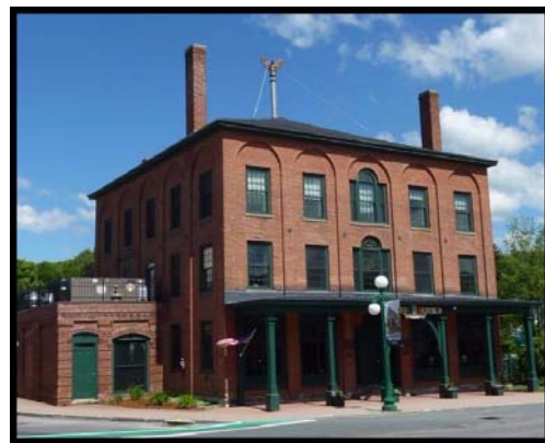
Eagle Block in Newport.

This is also Thanksgiving month. President Lincoln was inspired by Sarah Josepha Hale of Newport, NH to proclaim the first national Thanksgiving in 1863. A statue to honor Hale is located quite near the LCHIP-assisted Eagle Block in Newport. A new "Day of Giving", the Tuesday after Thanksgiving, encourages people to provide time, treasure and talent to the non-profit organizations they care about. Consider how you might contribute on November 29th.