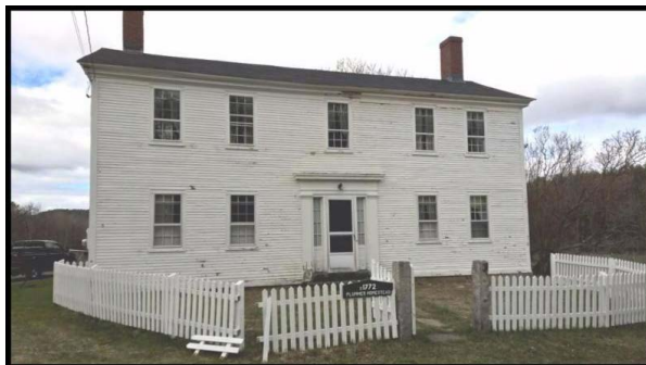
Plummer House

The Plummer Homestead is a farmstead in Milton composed of a series of interconnected structures built between 1780 and the 1870s. The property was owned by the Plummer family from 1780 to 1993, when it was deeded to the New Hampshire Farm Museum. Its twenty acres continue as a working farm, with the land protected permanently by a conservation easement. The