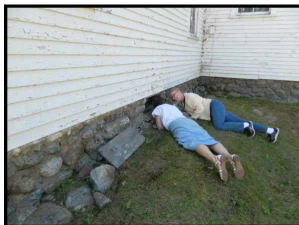
Center Harbor site visit - Examining the foundation of the Townhouse.

We have wrapped up our site visits, completed the Natural Resource Review Panel meeting and are preparing for the November 2nd Historic Resource Review Panel. We've seen an array of fascinating historic and natural resource sites and passionate project proponents. It makes us sad that there is not enough money to support all the projects that have applied.