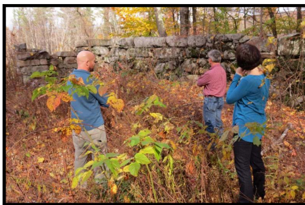
Stone Farm site visit - Pondering the history of the stone foundation.