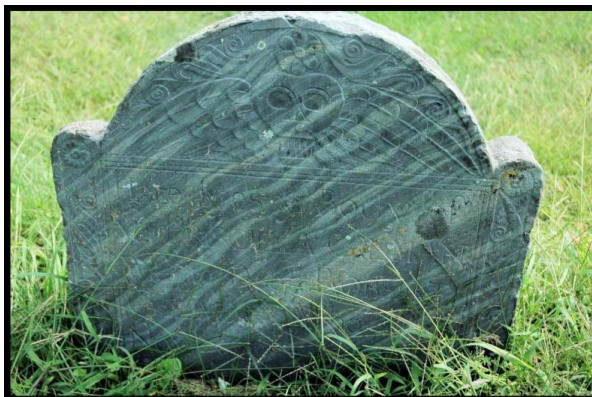
Headstone in Winter Street Cemetery

Step back in time and meet some of Exeter's famous and infamous former residents. At the historic Winter Street Cemetery you will be able to wander the cemetery and meet friendly spirits who will tell their stories and answer questions. Pre-registration is required. For more details and to purchase tickets visit the American Independence Museum website .