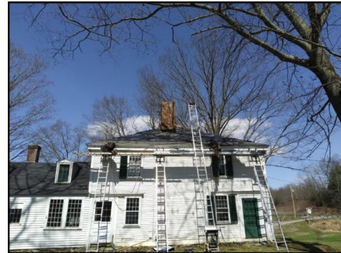
Because construction work is considered essential under the stay-at-home order, Hinsdale House got its new roof.

I hope you and all of those you care about are staying healthy and able to get out to enjoy lightly-used walking destinations near you.