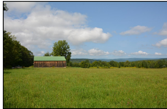
View westerly from Evans Farm toward Stratton Mtn and Mt. Snow in Vermont.