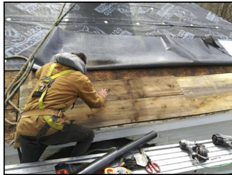
Up close and personal on the Hinsdale House roofing job