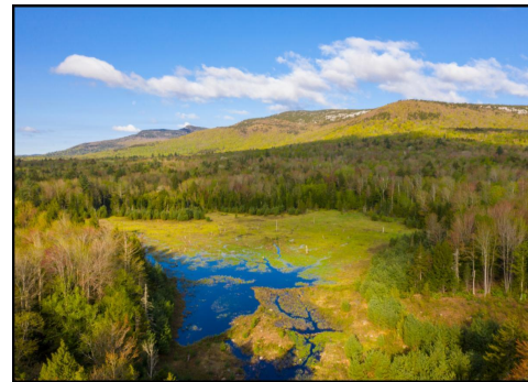
Sawyer Brook Headwaters beaver pond and forest

Under the epidemic-inspired stay-at-home order, being able to get out into nature has become more important than ever. New Hampshire people have been thronging to protected open space, from the White Mountain National Forest to Mt. Monadnock, Mt. Major and local conservation gems. A 2019 LCHIP grant will soon help the Town of Grantham acquire the 385-acre Sawyer Brook conservation area along Walker Road. The extensive trail network will be open to the public for low impact recreation and respite forever, under a conservation easement held by project partner the Ausbon Sargent Land Preservation Trust .