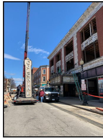
Colonial Theater rehabilitation is underway this spring.

A big project to rehabilitate a notable building in downtown Laconia is transforming the formerly vacant Colonial Theater into a vibrant and beautiful landmark once again. Originally built in 1914 as a vaudeville theater by Benjamin Piscopo, it was later divided into a five-screen multiplex movie theater. Now, an ambitious plan to revitalize the property - which includes commercial and residential space - promises to help revitalize downtown Laconia. The Belknap Economic Development Council is spearheading the project, with the assistance of LCHIP, the Community Development Finance Authority, the City of Laconia, and investment incentives, such as Historic Tax Credits, along with private donors and investors.